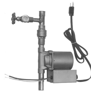
(Flow Control Module)