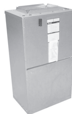
Unit shown with optional bottom return air kit (#90PK4 or #90PK5)