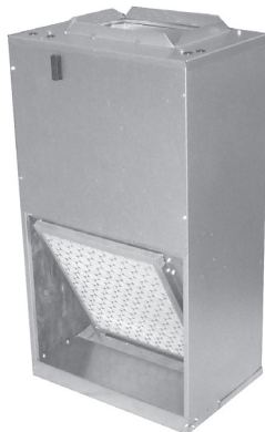
Unit shown without wall panel (Closet application - Front Return Air)