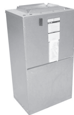
Unit shown with optional bottom return air kit (#90PK4 or #90PK5)