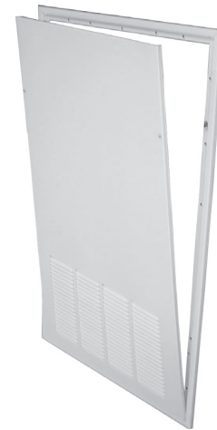
Optional wall panel (Recessed wall application)