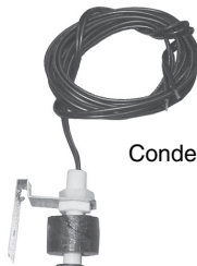
Condensate Overflow Switch #SS3